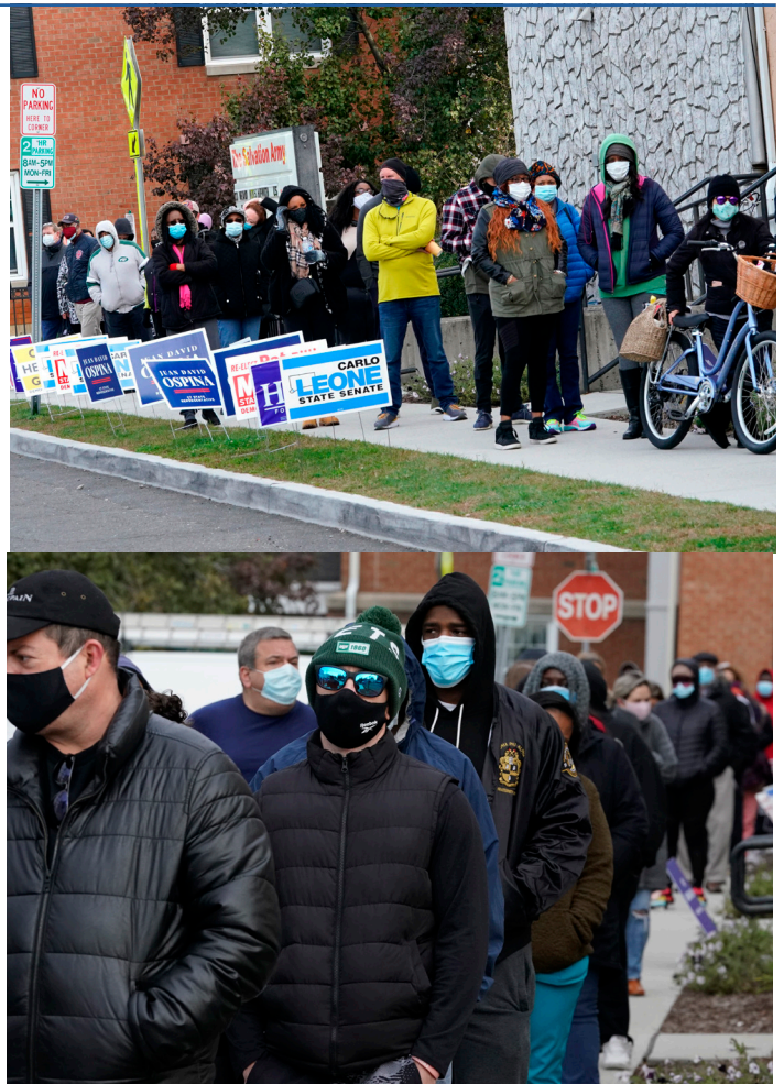
Voters wait to cast their ballots at the Salvation Army of Stamford, Connecticut on November 3, 2020.

With Black and Latino voters facing longer voting lines, no early voting (as of yet), and limited access to absentee voting, Connecticut has some of the most restrictive voting laws in the nation. Conditions that can foster voting discrimination — such as unfair districts or at-large systems that weaken Black and Brown voting power, inaccessible polling locations, insufficient language assistance for voters who don’t speak English, and even outright voter intimidation — endure throughout the Nutmeg State. One reason why is that many voting rights abuses happen at the local level, where the legal tools and resources to investigate and prosecute wrongdoing aren’t available.