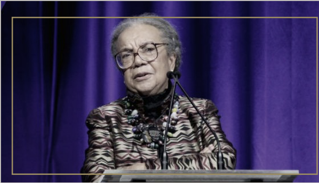
Honoree Marian Wright Edelman