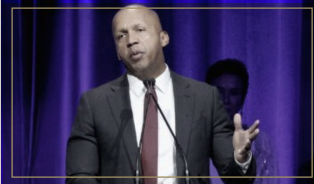
Honoree Bryan Stevenson