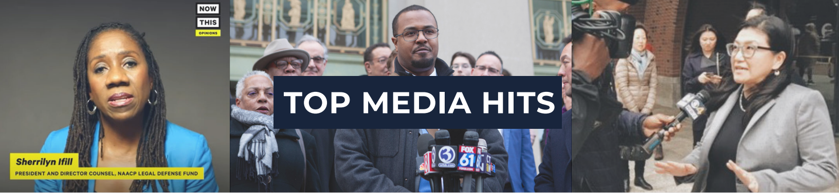
Sherrilyn Ifill PRESIDENT AND DIRECTOR COUNSEL, NAACP LEGAL DEFENSE FUND